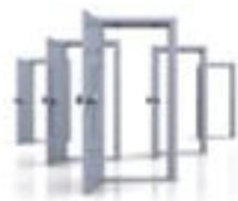
Cross Border Authentication for electronic services