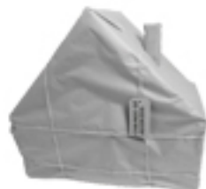
Change of Address