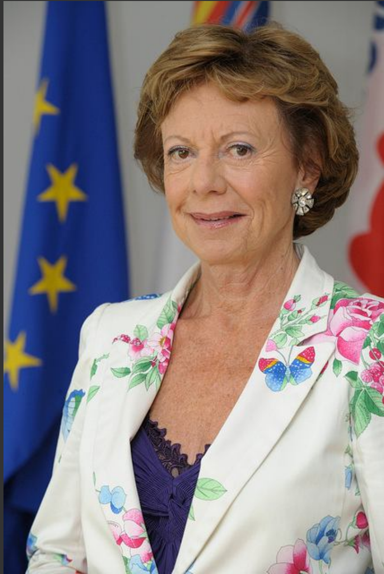
http://bit.ly/NeelieKroesEU , @NeelieKroesEU