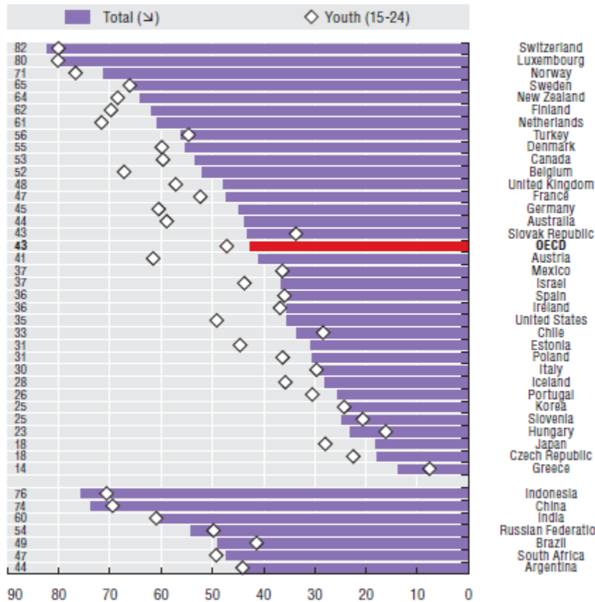
Panel A. Confidence in national government, 2012 (%)

The Swiss population has more faith in its Institutions than any other countries (82% of trust)