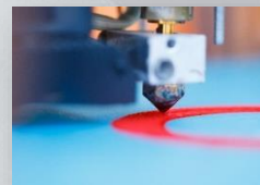
3D PRINTING & SCANNING Supply chain innovation