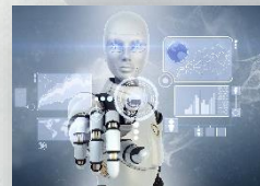
ROBOTICS Autonomous Mobile robots