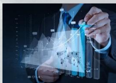
ANALYTICS Predictive risk control