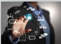
CLOUD COMPUTING Collaboration forms