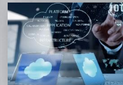
INTERNET OF THINGS Information flow integration