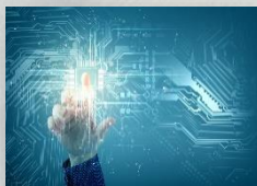
BIG DATA Knowledge base