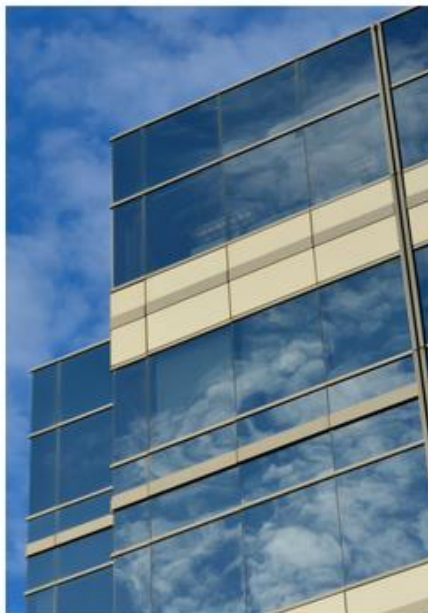
Private sector data