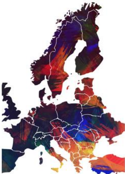
Public sector and publicly funded data