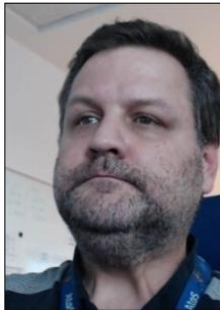
Appeared 4:09 PM at camera: Localhost.Cam0